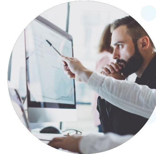
Facility Management Companies