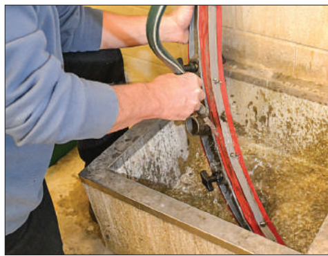
Clean & inspect squeegees regularly