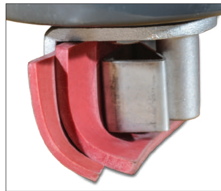
Too Much Pressure