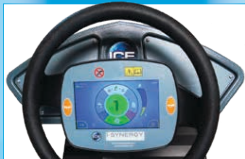
State-of-the-art touch panel control console