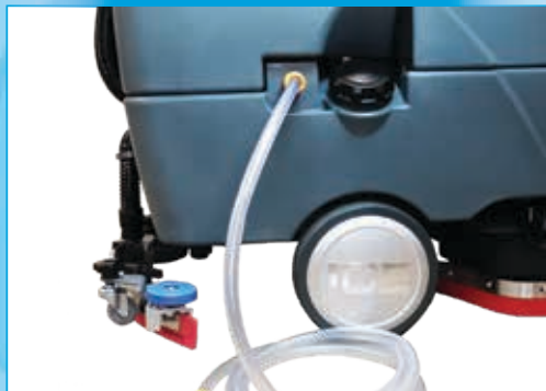
Quick-connect hose fill port